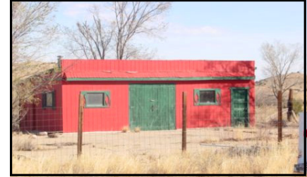
Workshop—wired w/wood stove